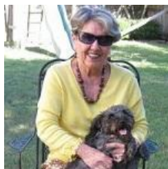
Rockett and Mom!

Little did I know when I decided to adopt/rescue a dog I would be bringing home a "true" rescue. Rockett is such a cuddle bug these days, which I would have never predicted, and is a true blessing to our family. He is our "Happy Tail!"