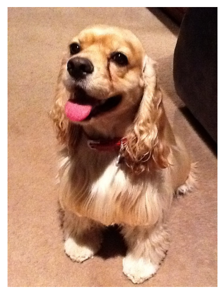
Clanton Families 3 year old adopted pup, Kirby!