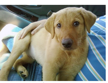
Duchess as a pup

July 15, 2011: Duke had been limping, so we got some anti inflammatory liver flavored pills along with glucosamine pills. Dutch was jealous. The counter has not