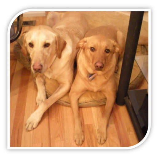
Duke and Duchess

April 21, 2010: We had bought a 50 inch plasma TV. We couldn't fit the TV with the box in the car, so we put the TV under a quilt to protect from Dutch. I see a chewed off plug next to the TV. Just as I