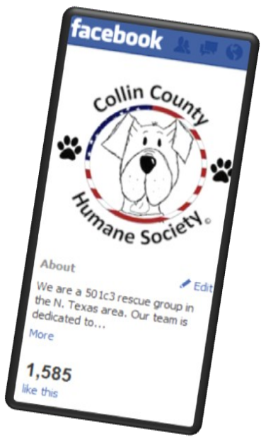
Over 1,500 Likes on Facebook! Come join us! facebook.com/CollinCountyHumaneSociety

but please someone tell them no more doggy piñatas.